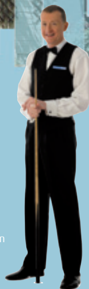
Steve Davis, OBE Six-times World Snooker Champion

A stylized signature of Steve Davis in purple ink.